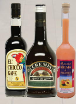
Liqueurs and Creams